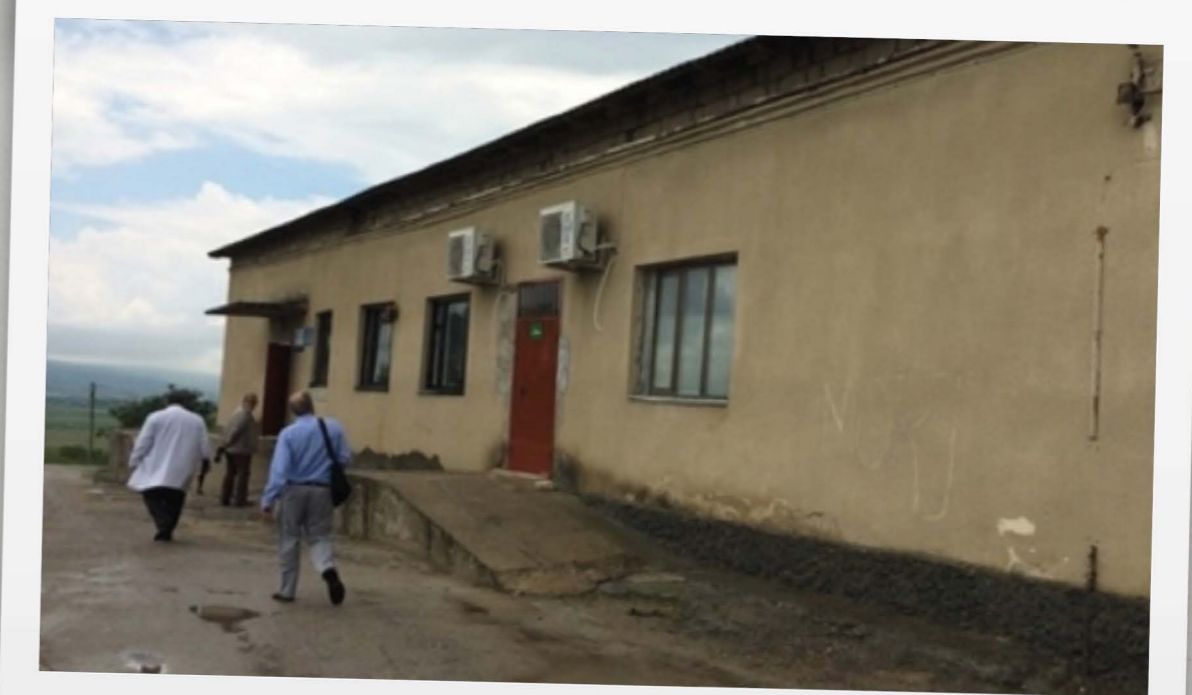
Visit to the Pathology Department at the Orhei District Hospital.