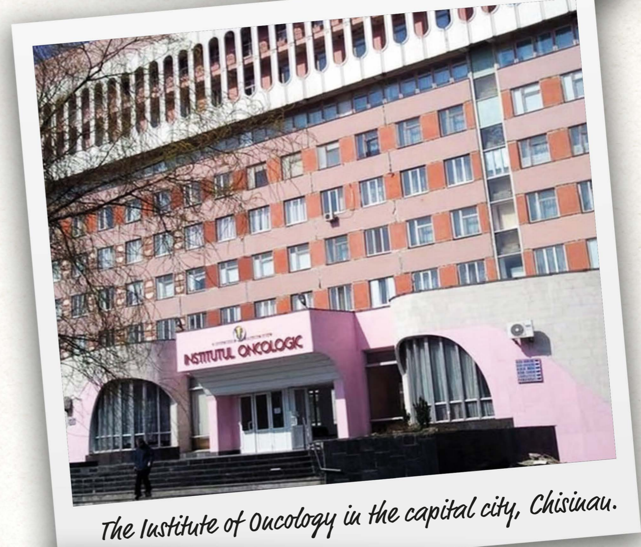
The Institute of Oncology in the capital city, Chisinau.