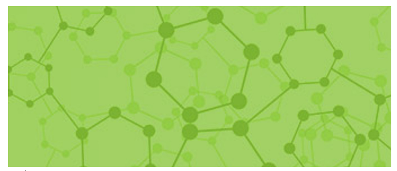
5 February 2025

passages, lungs and mediastinum. The talk is aimed at residents training in clinical pathology, medicine and oncology. Residents training in anatomic pathology and veterinary practitioners with an interest in cytology may also find it relevant.