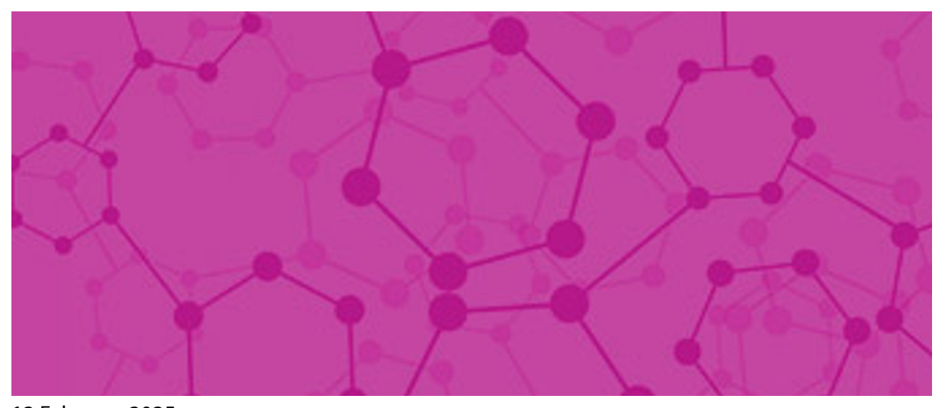
12 February 2025

We are delivering a free 4-part webinar series exploring 'Gross Examination and Frozen Sections'. This series will provide pathologists from around the world with skills to utilise outside of the laboratory to help facilitate progress in an academic career. Each webinar will have an international speakers delivering presentation followed by a Q&A session. This webinar is part 1 of this series and will be focusing on head and neck pathology and oncology surgery specimens.