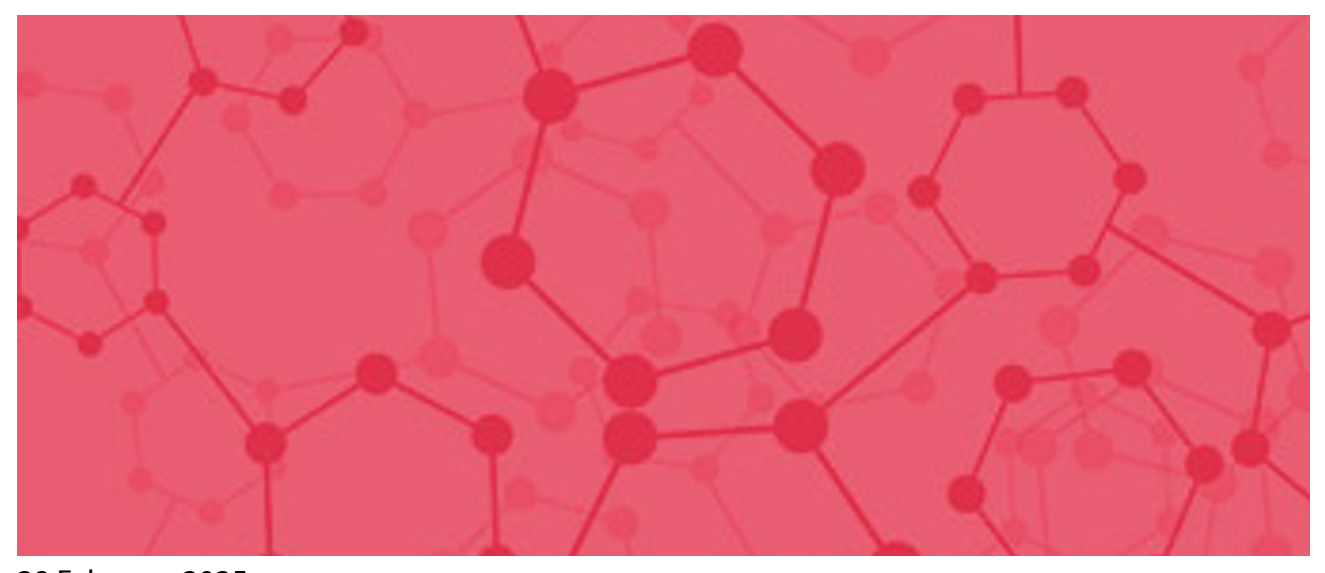
28 February 2025

We are delivering a free 4-part webinar series exploring 'Gross Examination and Frozen Sections'. This series will provide pathologists from around the world with skills to utilise outside of the laboratory to help facilitate progress in an academic career. Each webinar will have an international speakers delivering presentation followed by a Q&A session. This webinar is part 4 and the final one of this series and will be focusing on colorectal carcinoma specimens.