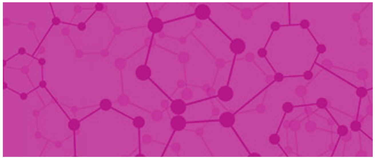
26 February 2025

We are delivering a free 4-part webinar series exploring 'Gross Examination and Frozen Sections'. This series will provide pathologists from around the world with skills to utilise outside of the laboratory to help facilitate progress in an academic career. Each webinar will have an international speakers delivering presentation followed by a Q&A session. This webinar is part 3 of this series and will be focusing on gynecological pathology and oncology specimens.