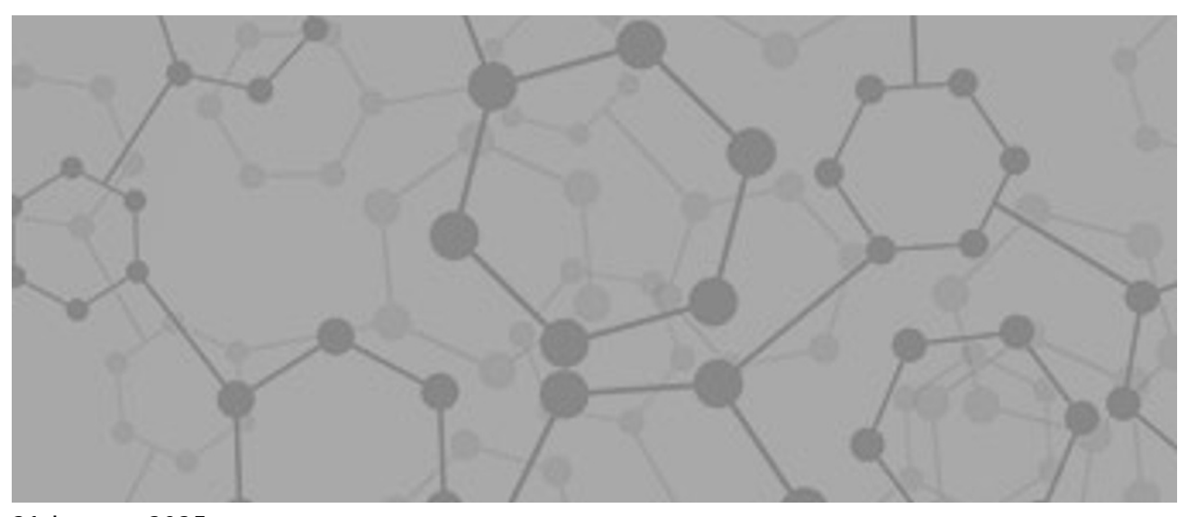
21 January 2025